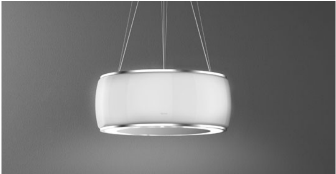
The photograph is purely for information It may not correspond to the selected version.